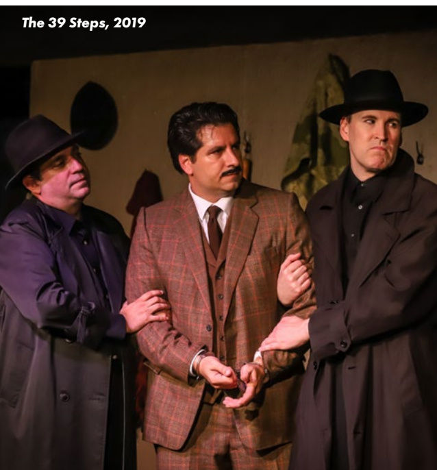
The 39 Steps, 2019