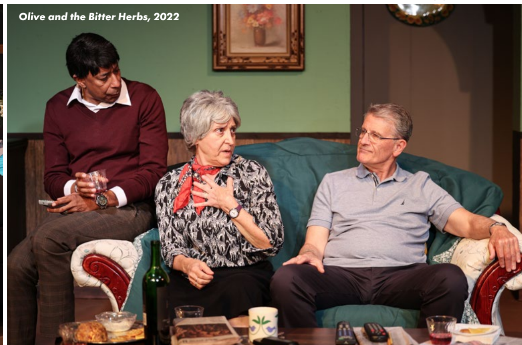
Olive and the Bitter Herbs, 2022