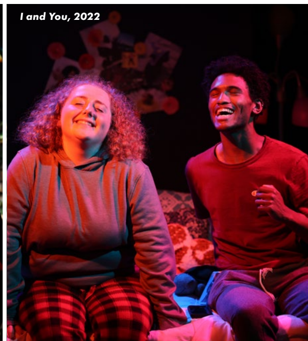
I and You, 2022